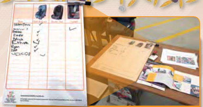
A safe car travel poster near the daily sign in sheet

Contact us to find out about holding a Kids and Traffic Driveway Safety Display at your service.